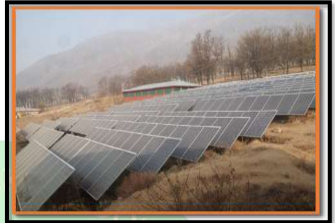
150 KW Solar Plant