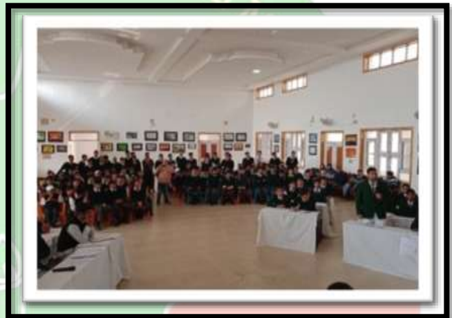
National Youth Parliament- Empowering the Young Minds & Training for Tomorrow