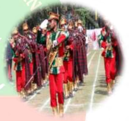
Unique Way of Celebrating Our National Festivals