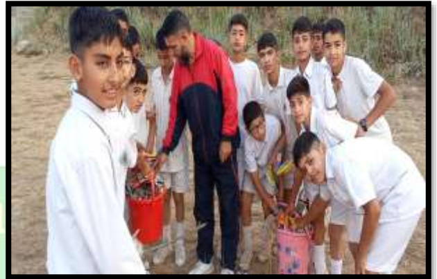
Swachhta Pakhwada : Pledge & Activities