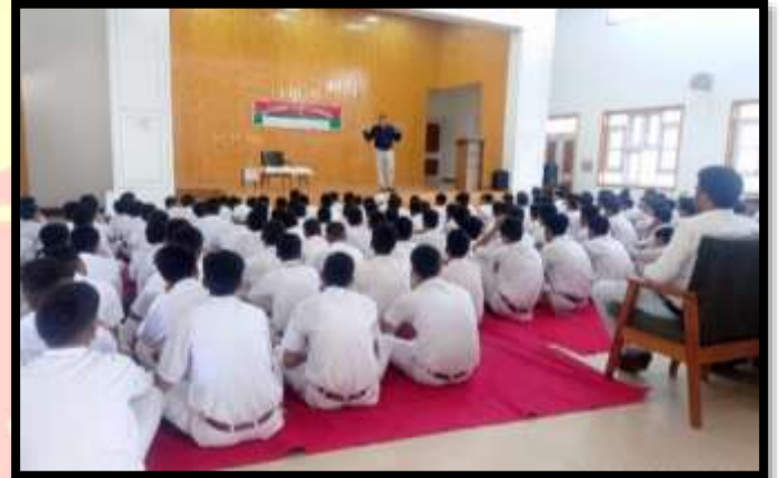
Motivation Lecture by Brigadier NS Khajuria