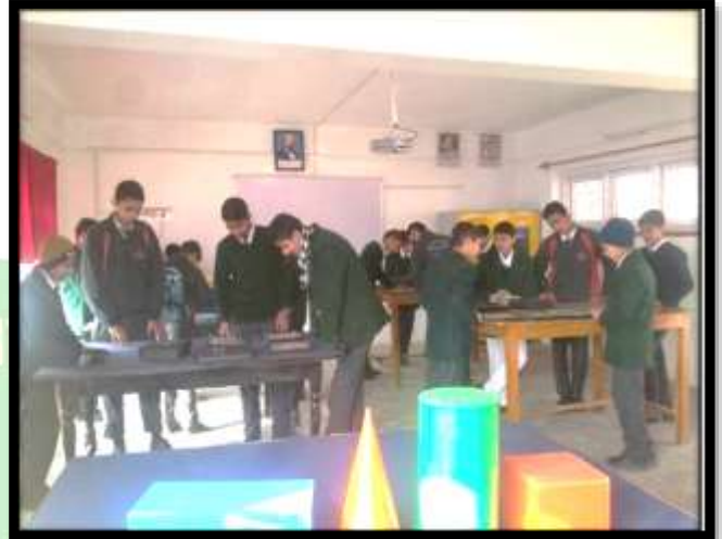
Digital Mathematics Lab