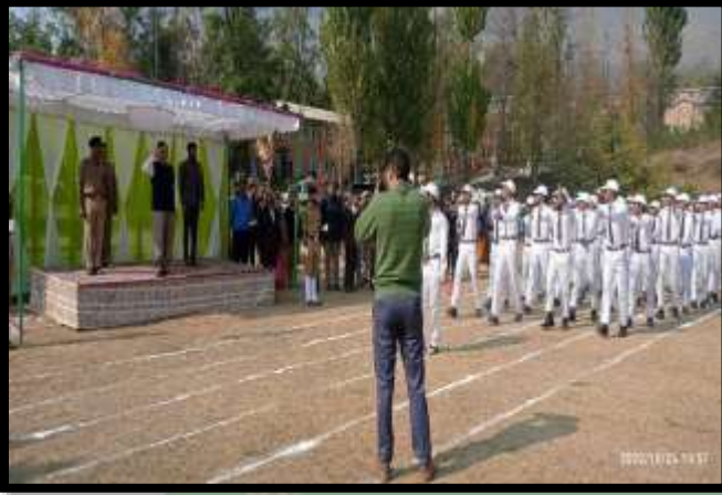
Dr. Rajkumar Ranjan Singh, Union Minister of State for Education and External Affairs, during his visit to school