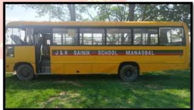
School Bus & Eco Van