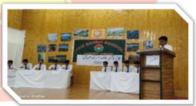
Urdu Declamation on Allama Iqbal (RA)