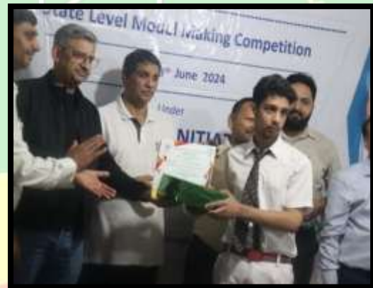
1 st Positions in UT Level Model Making Competition-2024 (Both Junior & Senior Category)