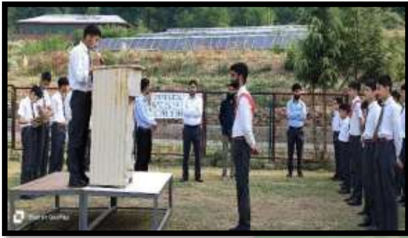
International Day for Biological Diversity-2024