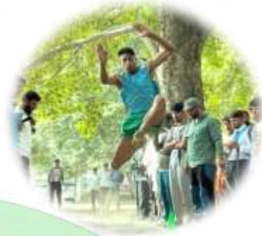
Setting Milestones for Excellence