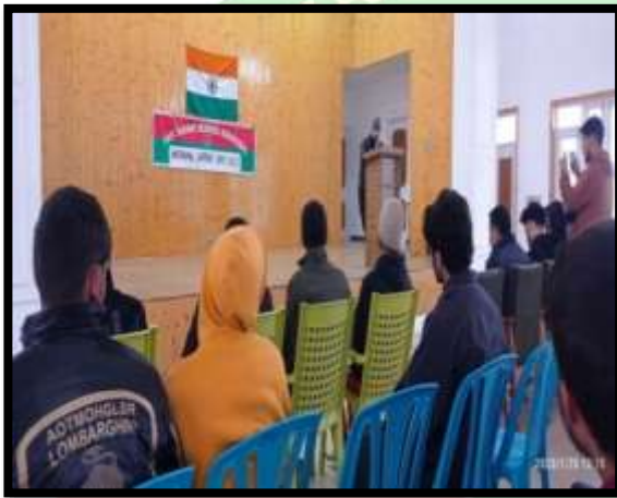
Awareness campaign National Voters Day