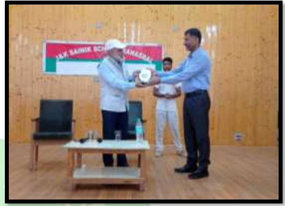
Motivational Lecture by Colonel Nazir Hussain