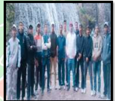
Rock Garden Chandigarh