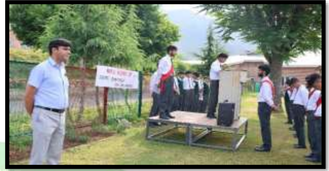
World Ocean Day