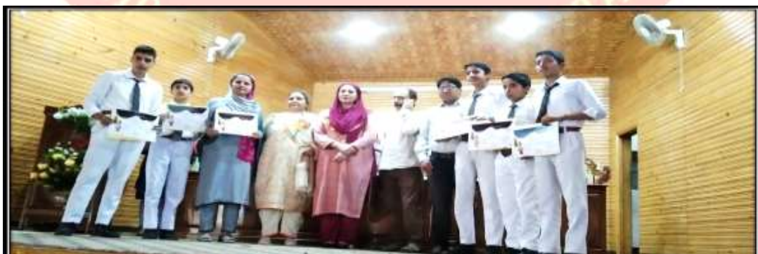
First Three Positions in Hindi Essay Competition and 2 nd & 3 rd positions in Hindi poetry competition, held at University of Kashmir.