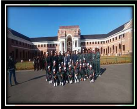
Forest Research Institute, Dehradun