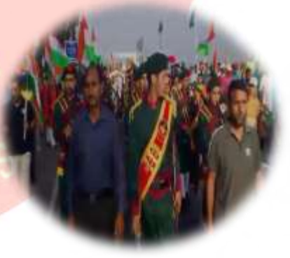
Tiranga Rally-2024: Display of Patriotic Fervour