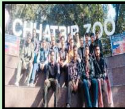
Chattabir Zoo Chandigarh