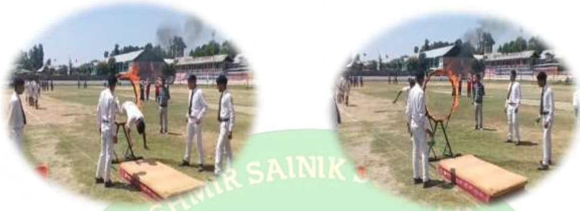
Daredevil Show at Qamaria Ground Ganderbal