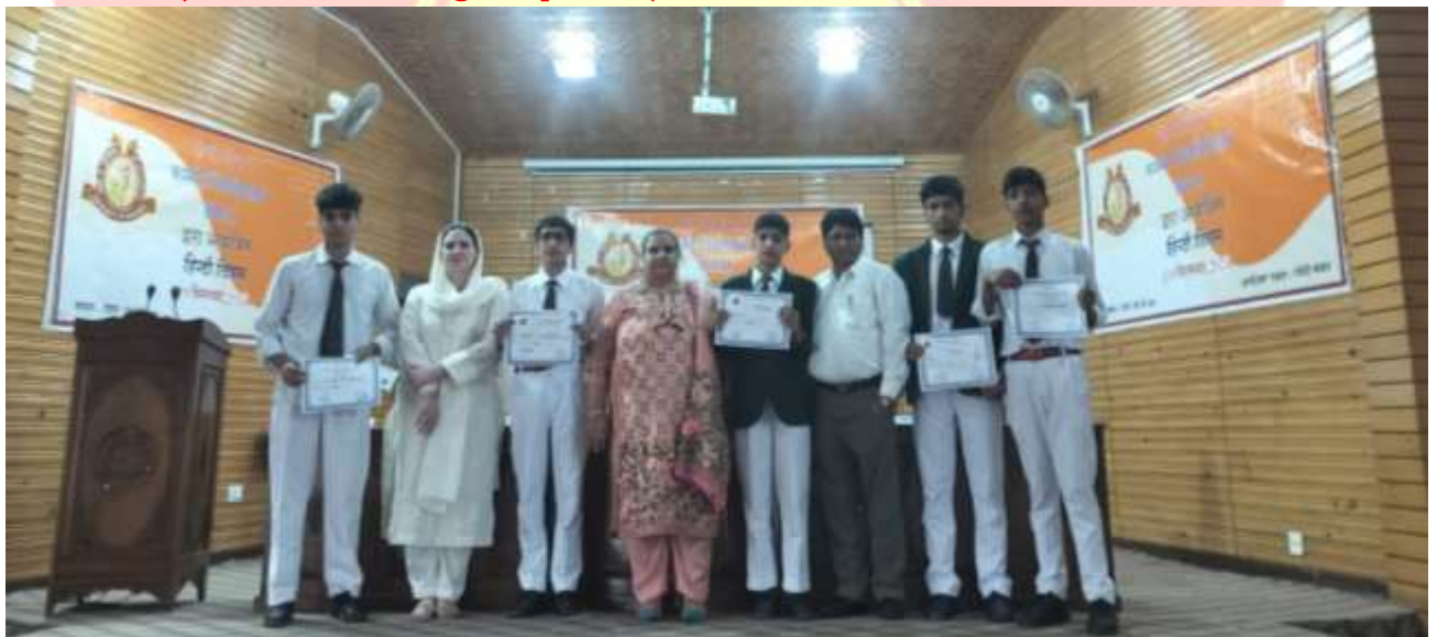
1 st Position in Poetry Reading & Essay Writing at University of Kashmir, 2024